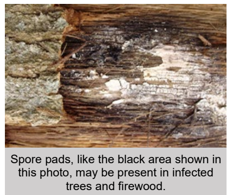
Spore pads, like the black area shown in this photo, may be present in infected trees and firewood.