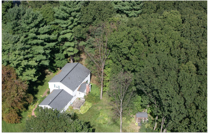
Aerial and ground surveys will help locate new infected trees

Activities will include establishing quarantine districts, and may also include the removal of infected trees, removal of nearby non-infected oak trees to prevent the spread of oak wilt through tree roots, and/or the installation of trenches to sever root connections. As with surveying, property owners will be informed of the management strategy for oak wilt at their site prior to conducting any activities.